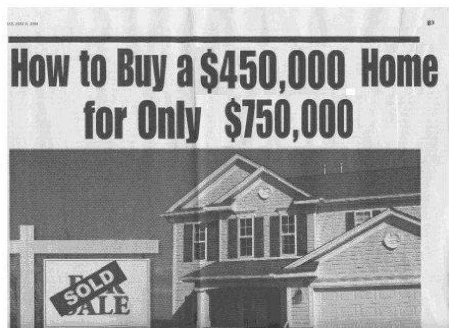
Truth in Advertising?